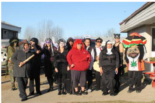
2011 Staff Halloween Dress-up