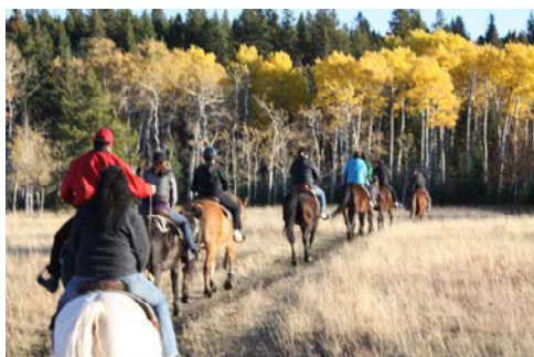
2011 Staff Retreat Ranch 6 Trail Ride