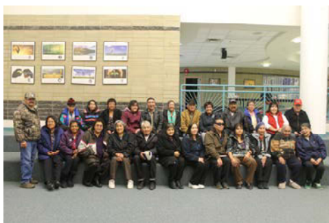
2011 Elders Community Supper Whitefish Lake First Nation